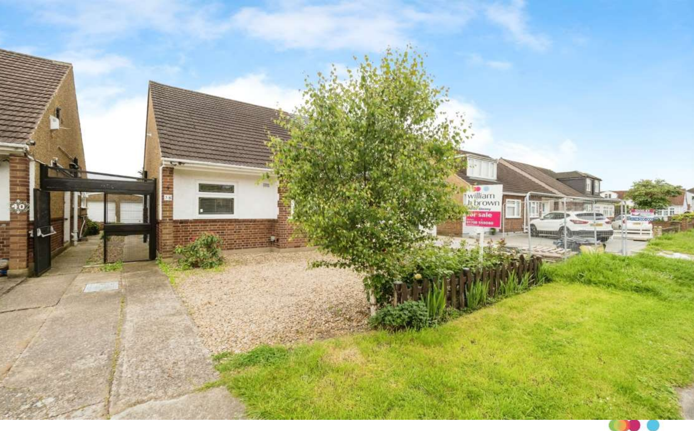
Arterial Avenue, Rainham, RM13 9PD