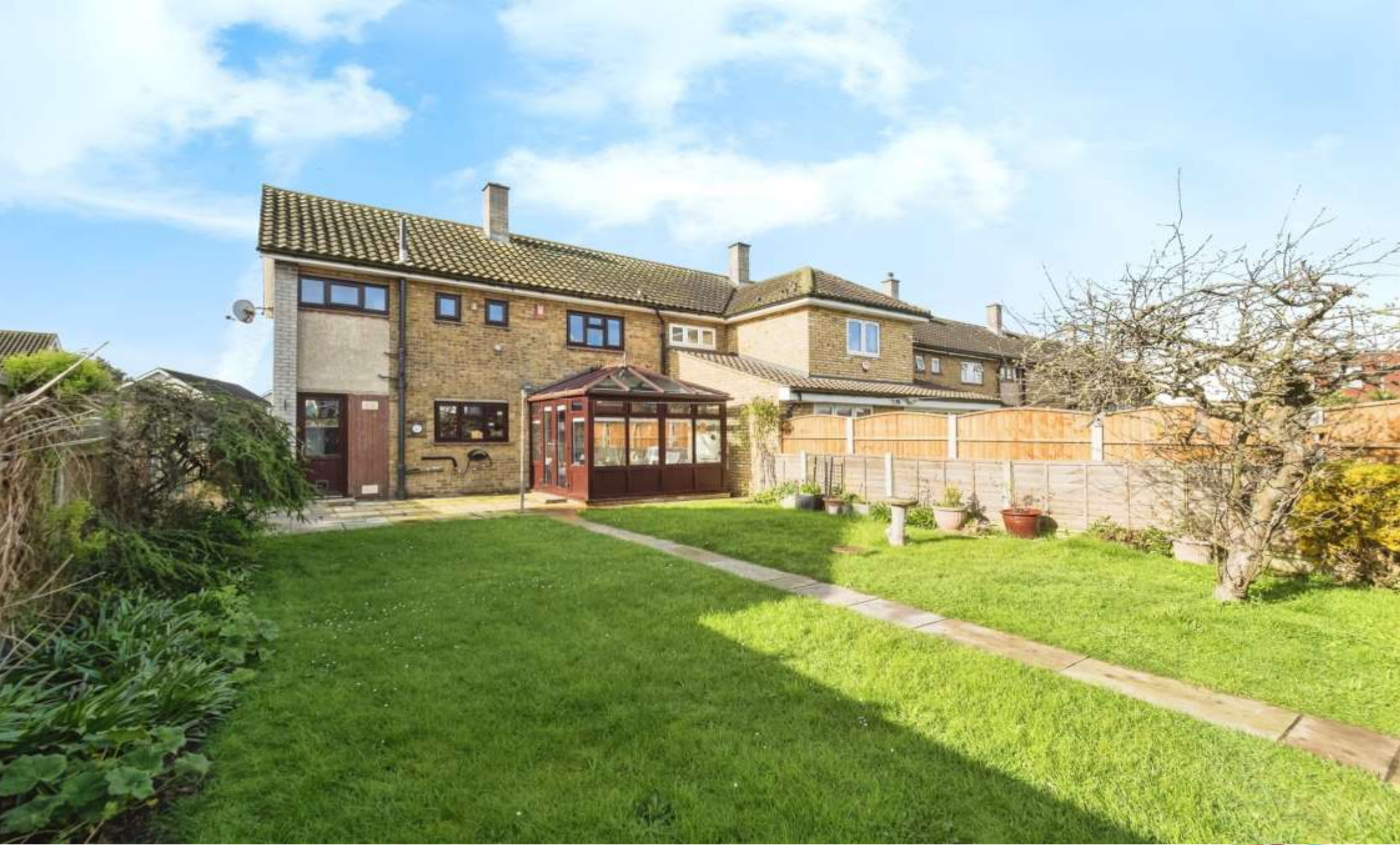
Theydon Gardens, Rainham, RM13 7TU