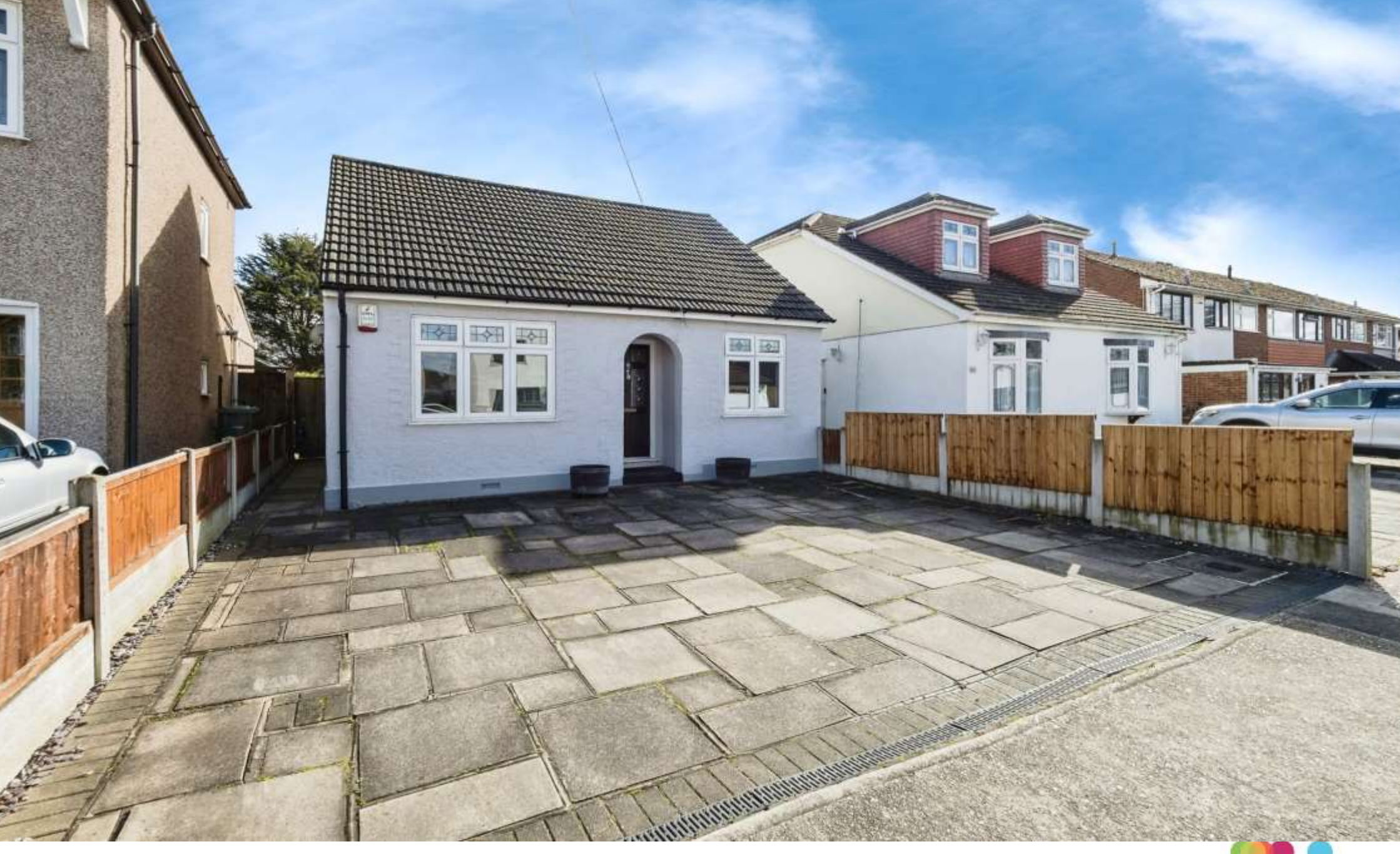
Hubert Road, Rainham, RM13 8AH