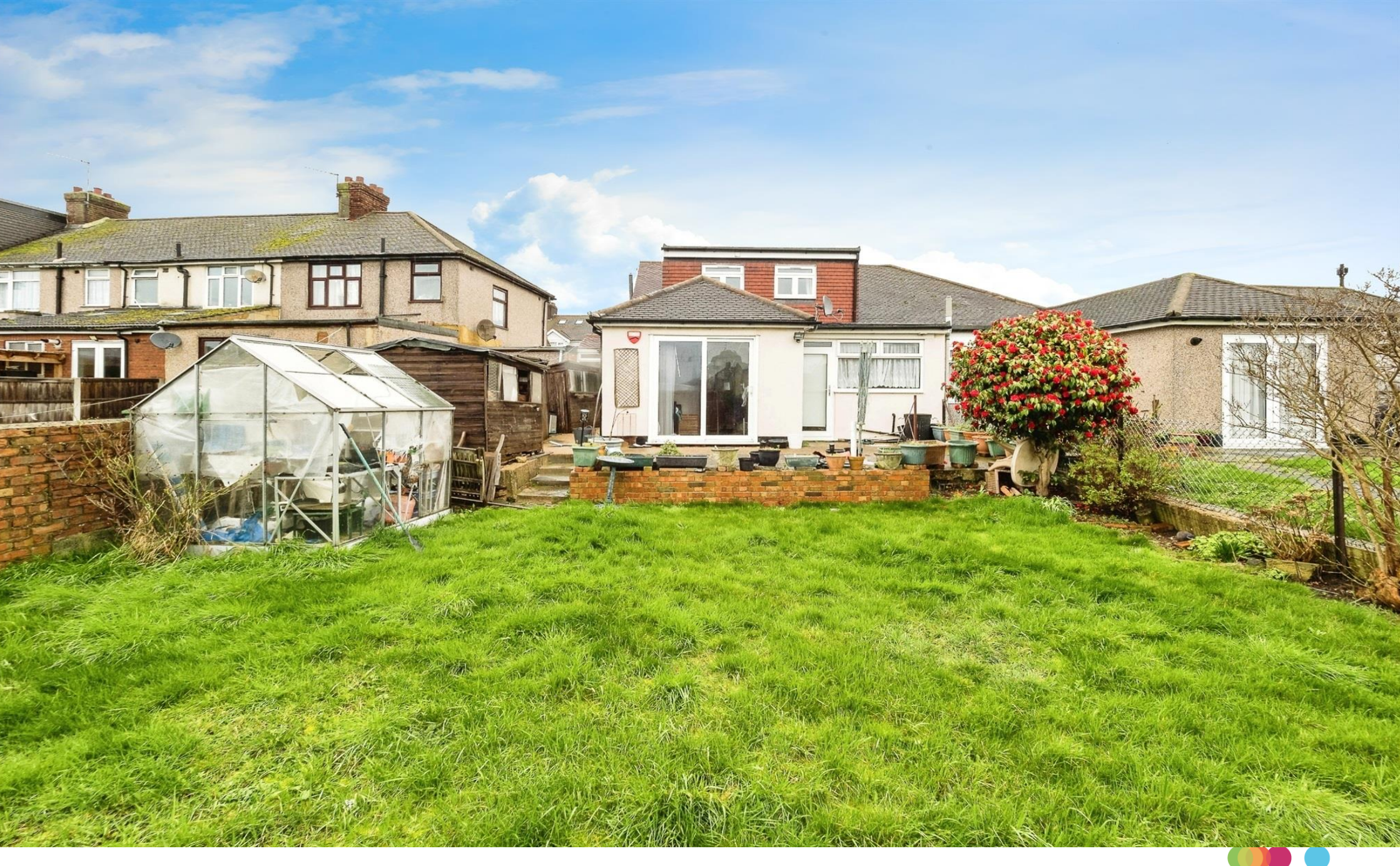
Rothbury Avenue, Rainham, RM13 9HZ