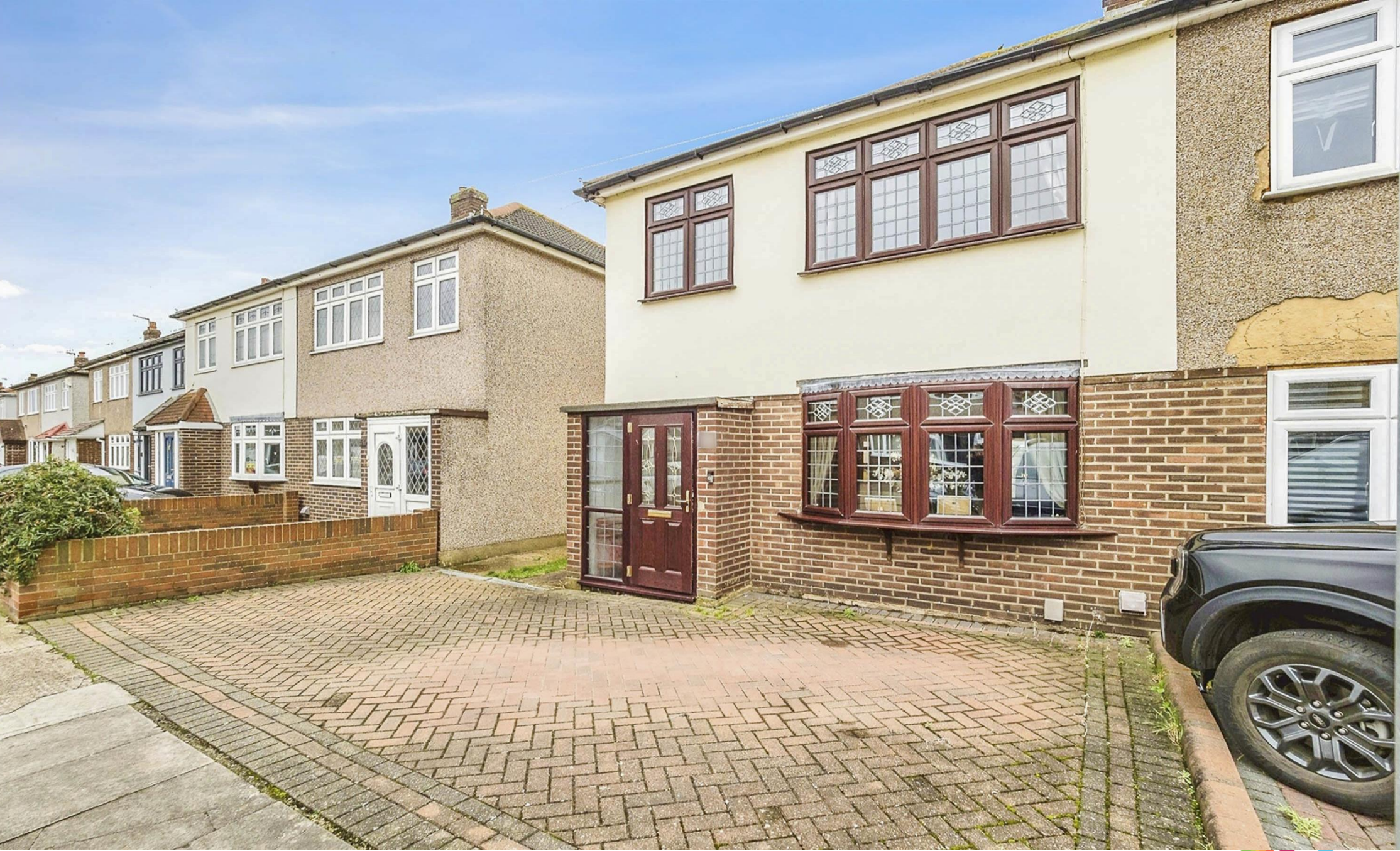
Lakeside, Rainham, RM13 9SN