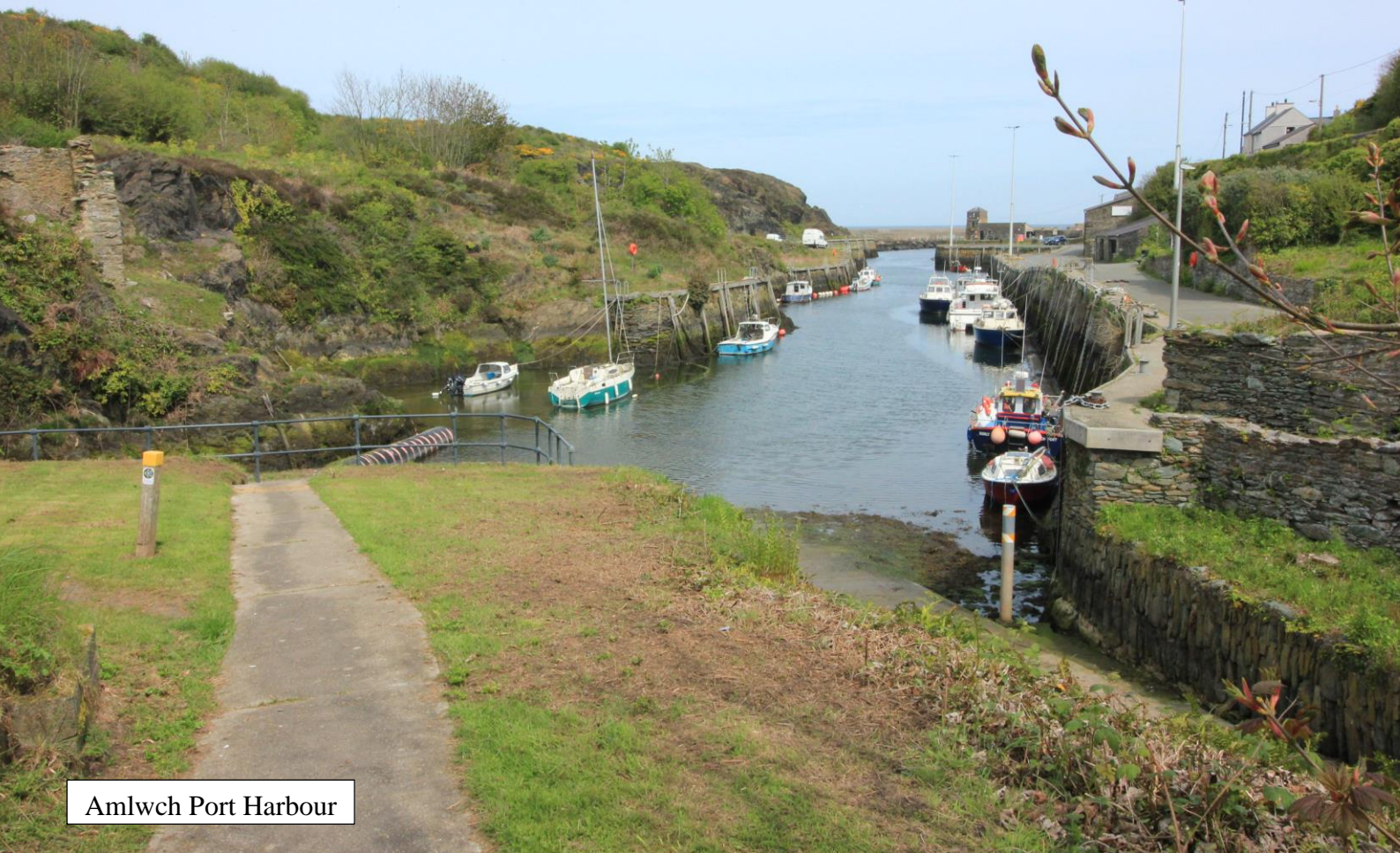
Amlwch Port Harbour