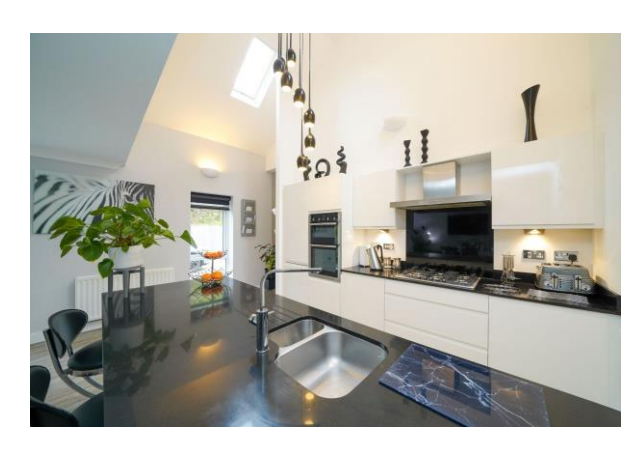
Kitchen Additional Pictures