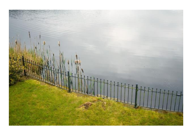
External Additional Pictures