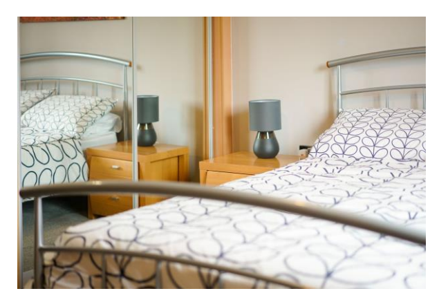
Bedroom 2 En-suite