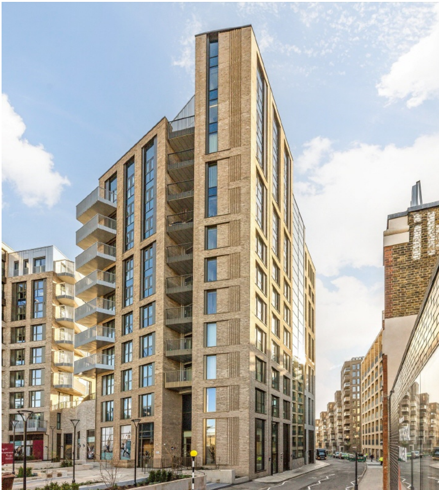
Paragon Square, WC1X £1,300,000