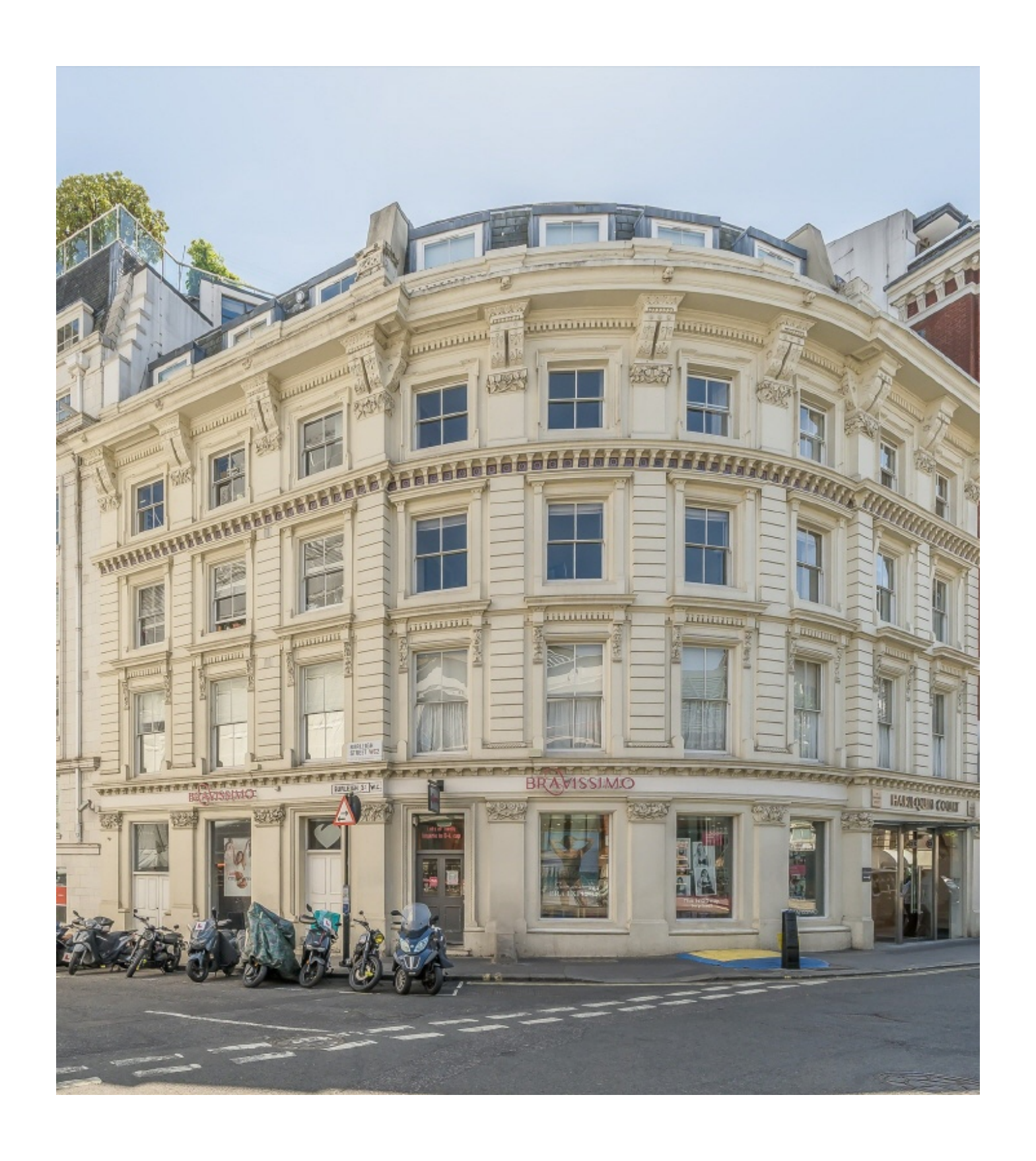
Tavistock Street, WC2E £1,250,000