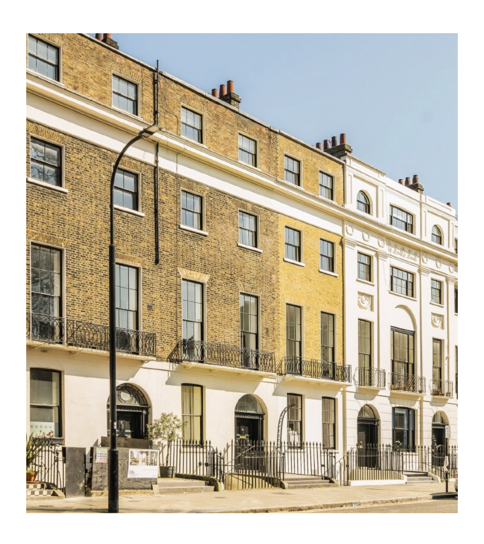
Mecklenburgh Square, WC1N £4,250,000