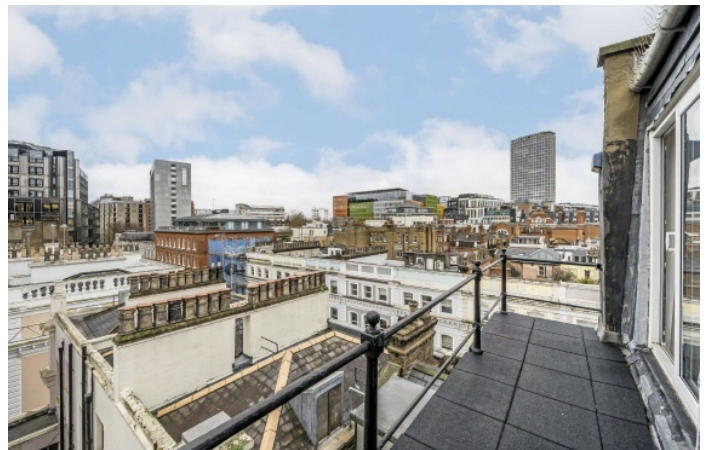
Great Russell Street, WC1B