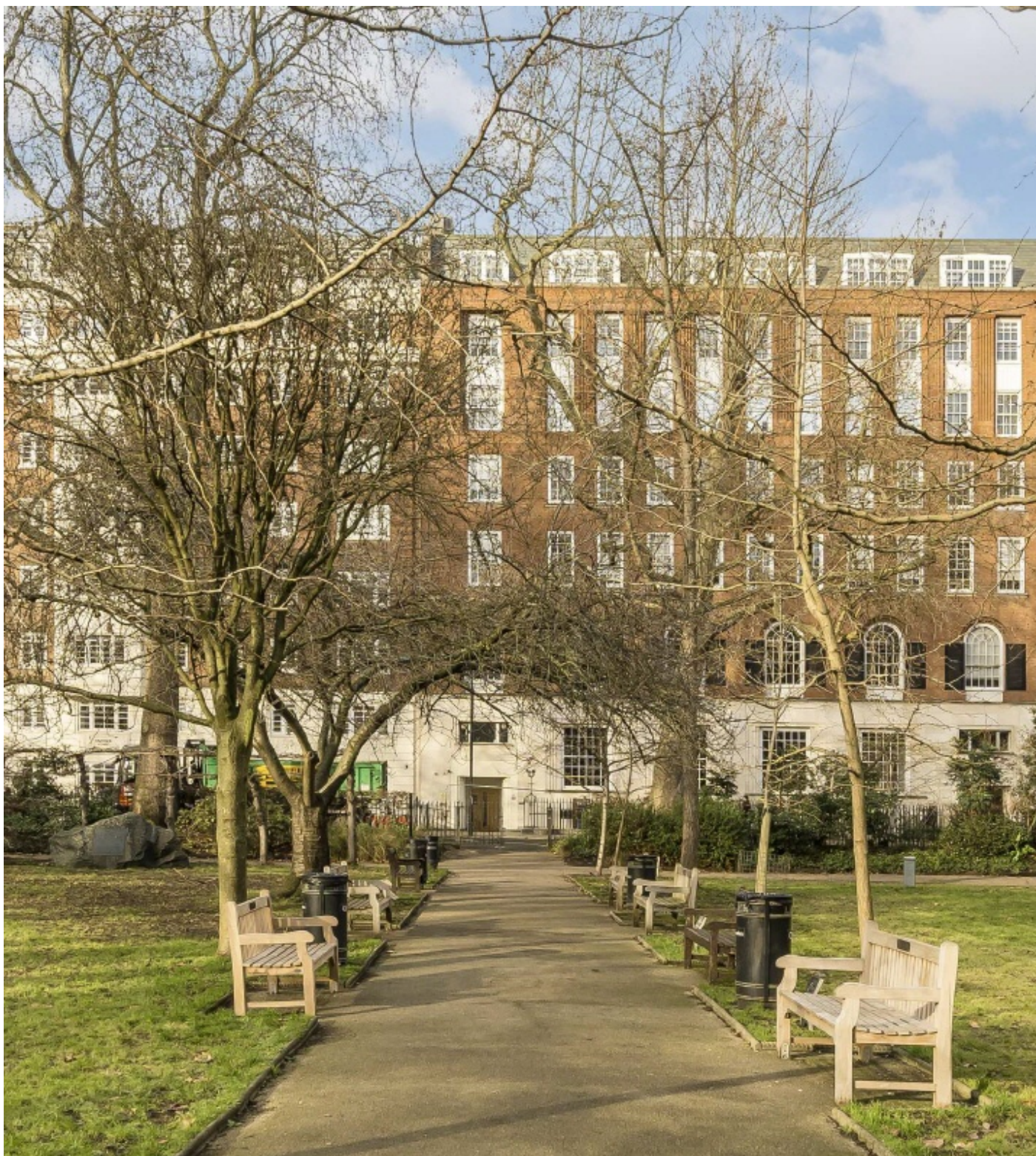
Tavistock Square, WC1H £950,000