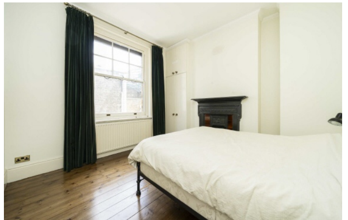
Southampton Row, WC1B