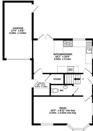
GROUND FLOOR - ROOM HEIGHT = 2.67M