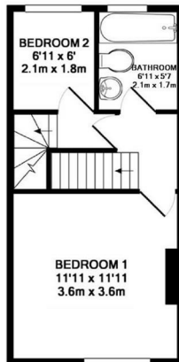
1ST FLOOR APPROX. FLOOR AREA 291 SQ.FT. (27.0 SQ.M.)