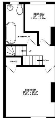
1ST FLOOR 304 sq.ft. (28.2 sq.m.) approx.