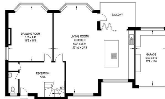
GROUND FLOOR 110.0 SQ M / 1183.9 SQ FT

Illustration for identification purposes only, measurements are approximate, not to scale.