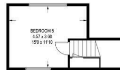
SECOND FLOOR 19.9 SQ M / 214.2 SQ FT