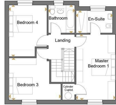
First Floor 64 sq.m. 689 sq.f.