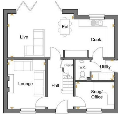
Ground Floor 64 sq.m. 689 sq.f.