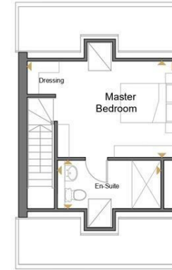
Second Floor 39 sq.m. 689 sq.f.