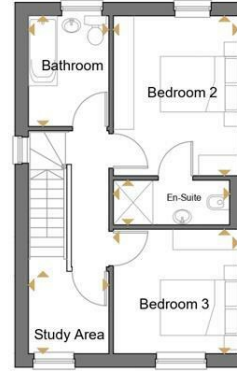
First Floor 42 sq.m. 689 sq.f.