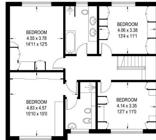
FIRST FLOOR 92.9 SQ M / 1000 SQ FT

Illustration for identification purposes only, measurements are approximate, not to scale.