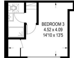
SECOND FLOOR 18.6 SQ M / 200 SQ FT

Illustration for identification purposes only, measurements are approximate, not to scale.