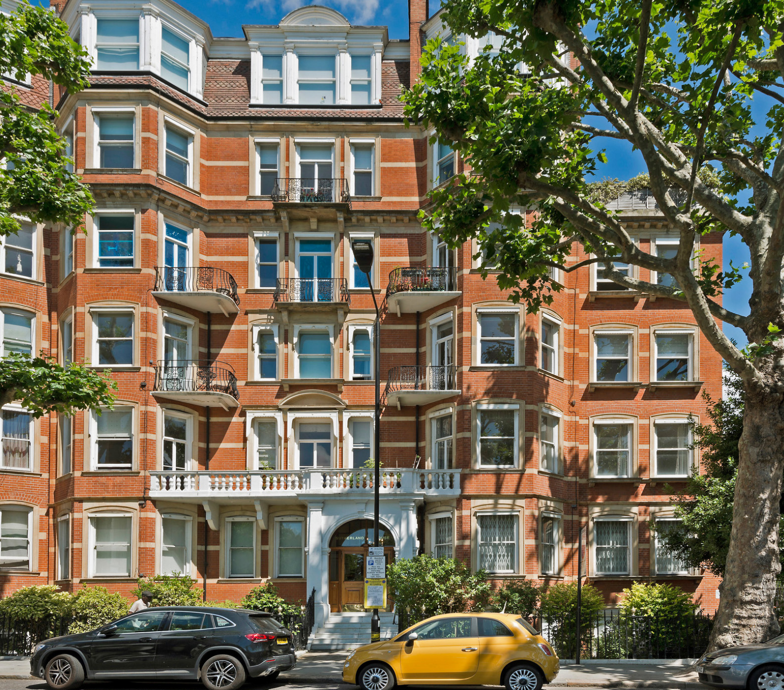
Sutherland House, Marloes Road, W8