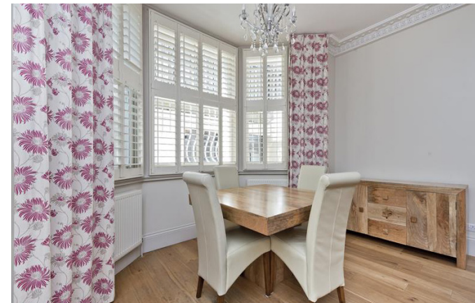
De Vere Gardens, W8