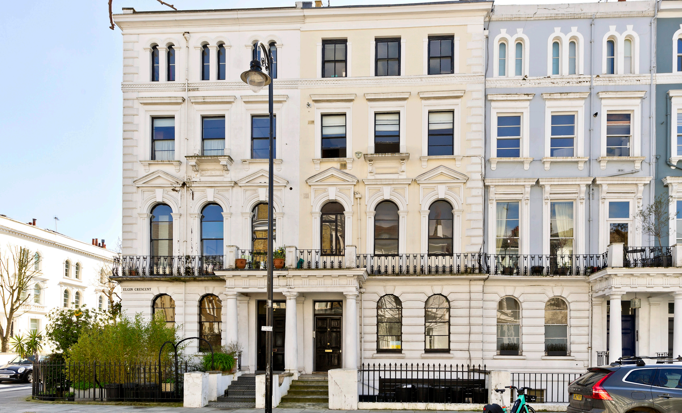
Elgin Crescent, W11