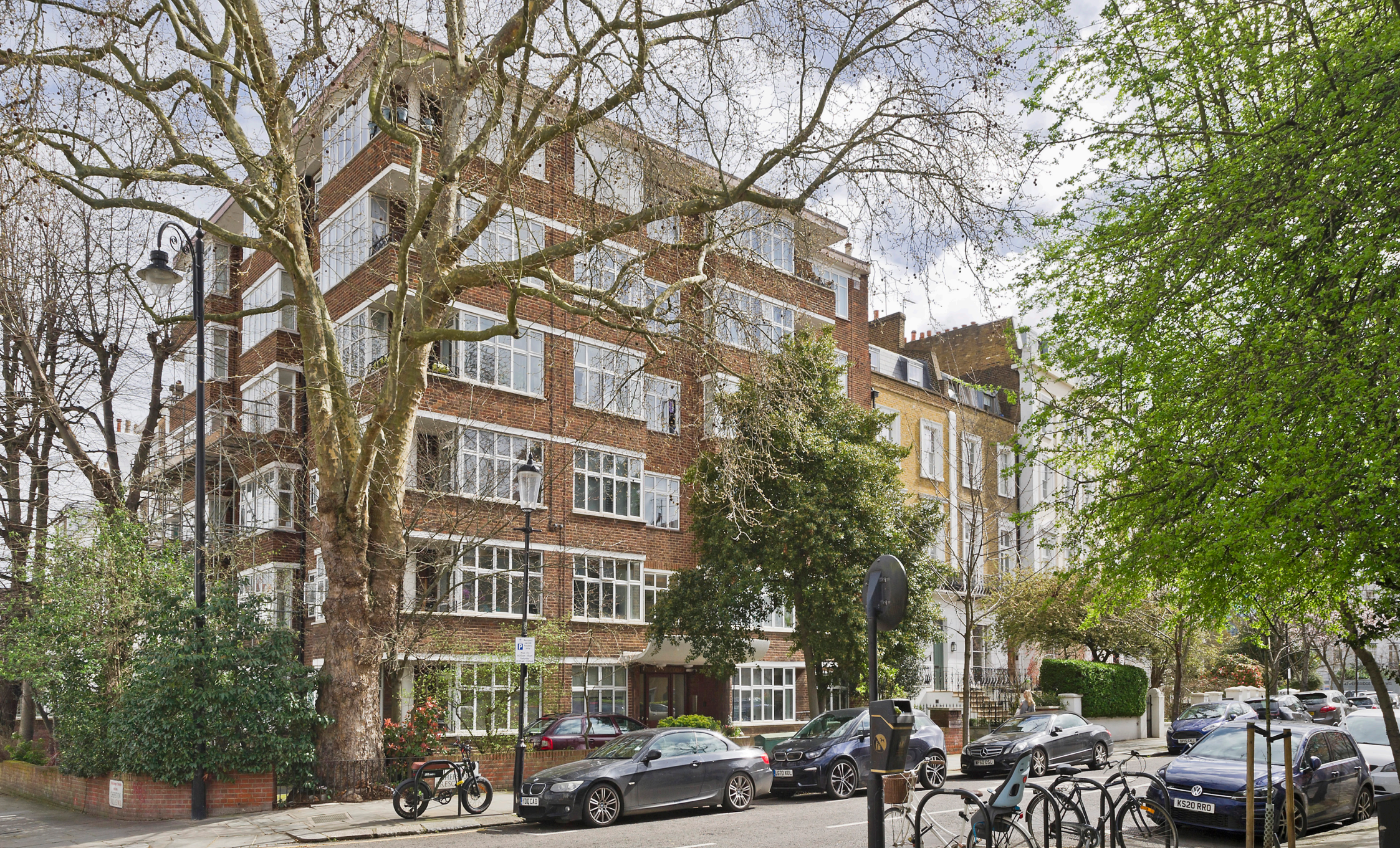
Chepstow Court, W11