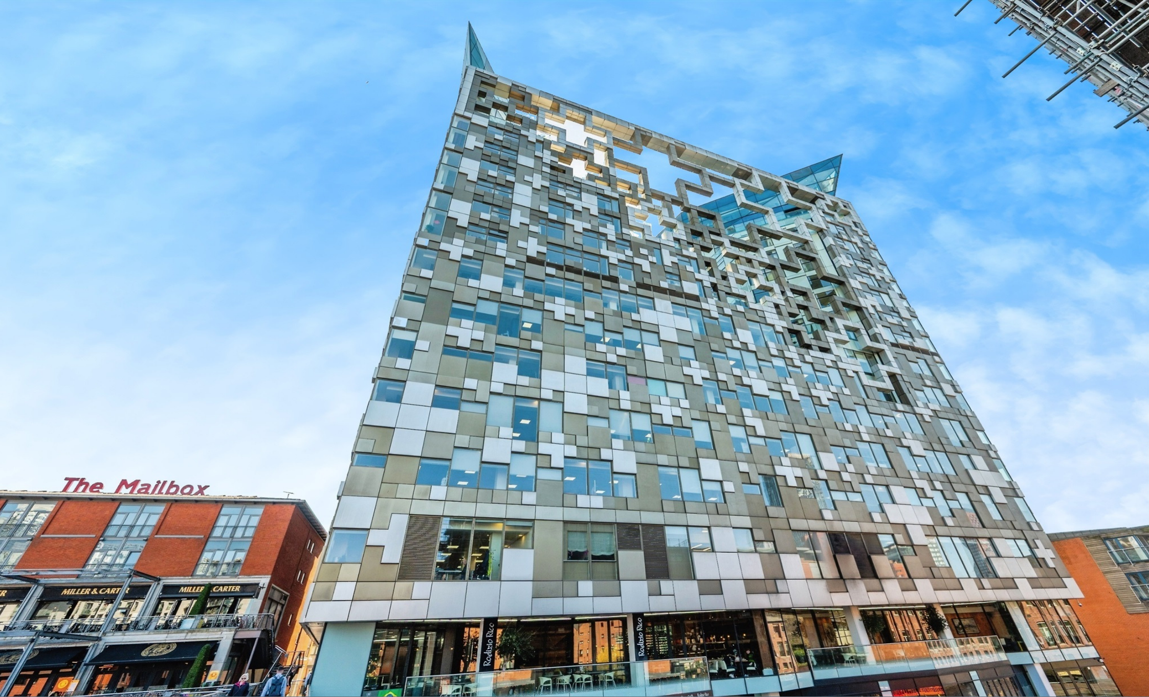
The Cube East Wharfside Street Birmingham