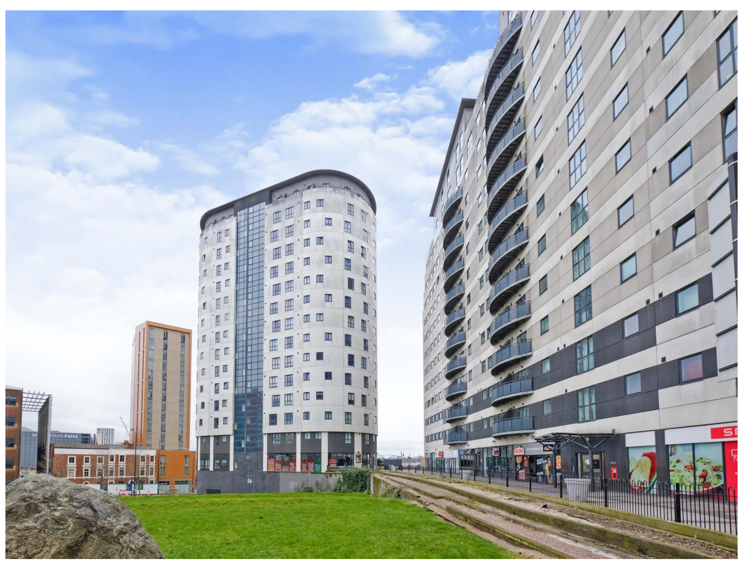
Masshouse Plaza Birmingham B5 5JL

Connells is delighted to offer this beautiful and modern studio apartment for sale on the market at a very acceptable price indeed!