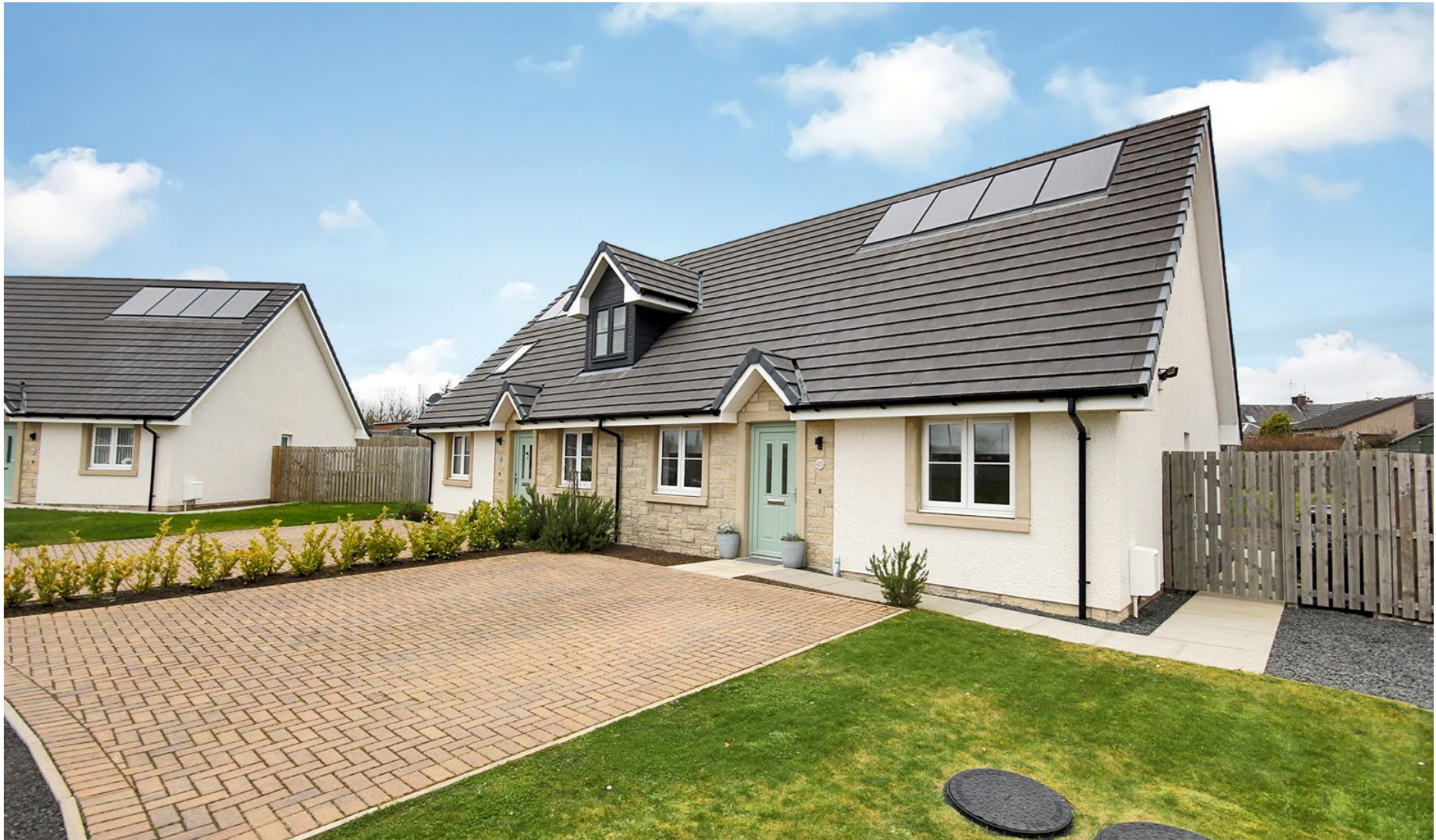
12 The Old School Yard, Auchinleck, Cumnock KA18 2DF Offers Over £150,000