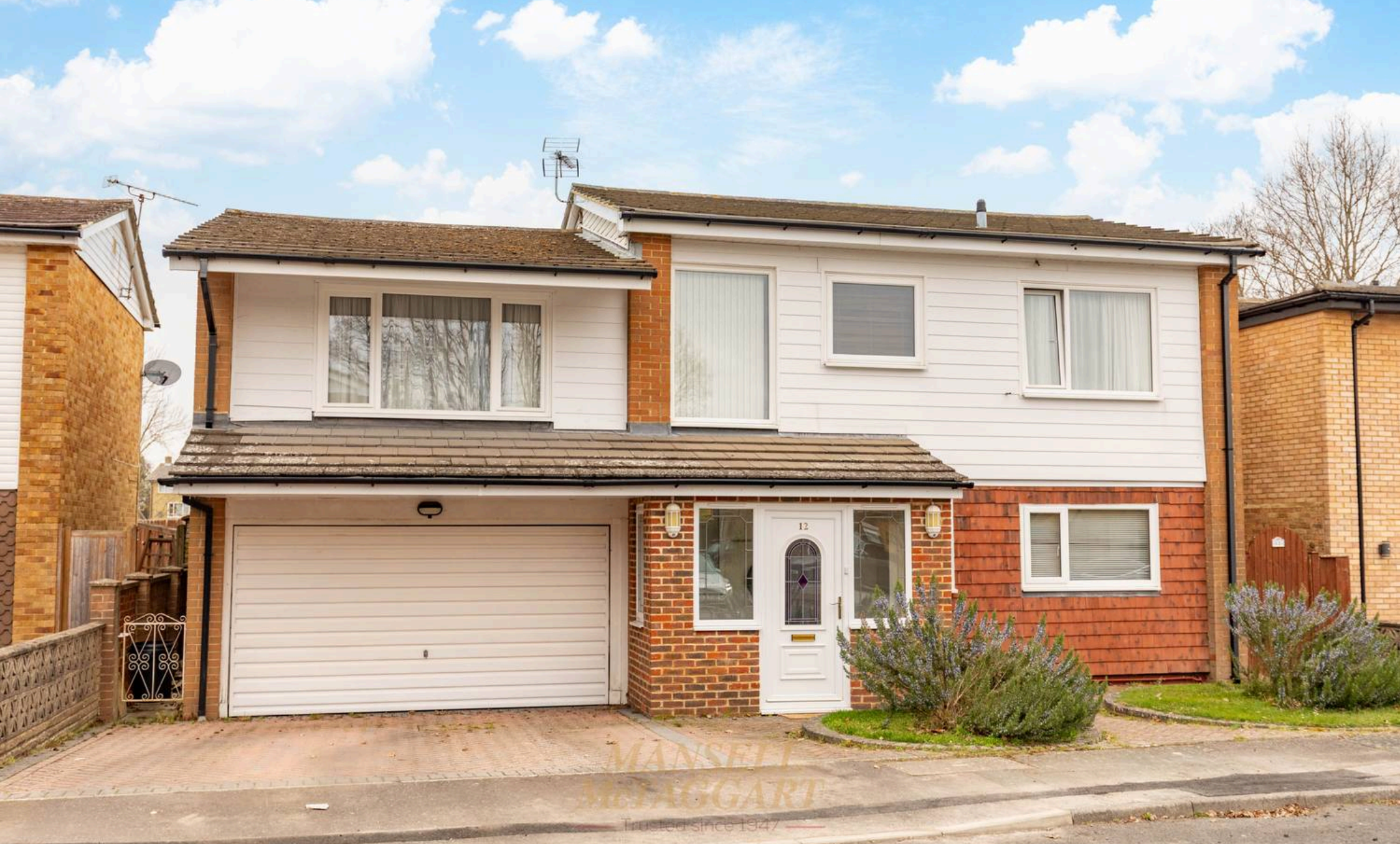
Artel Croft, Three Bridges £800,000