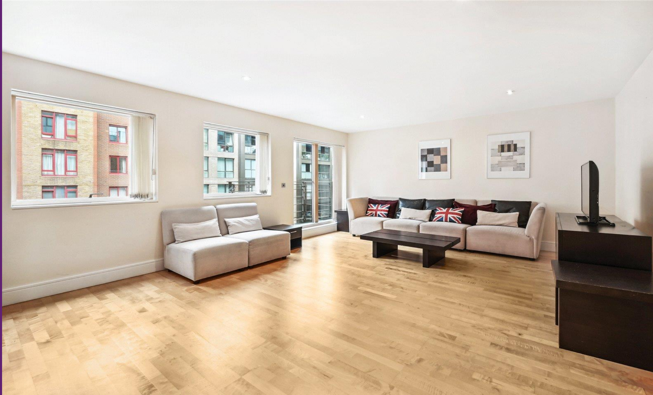
Cavendish House 31 Monck Street, SW1P