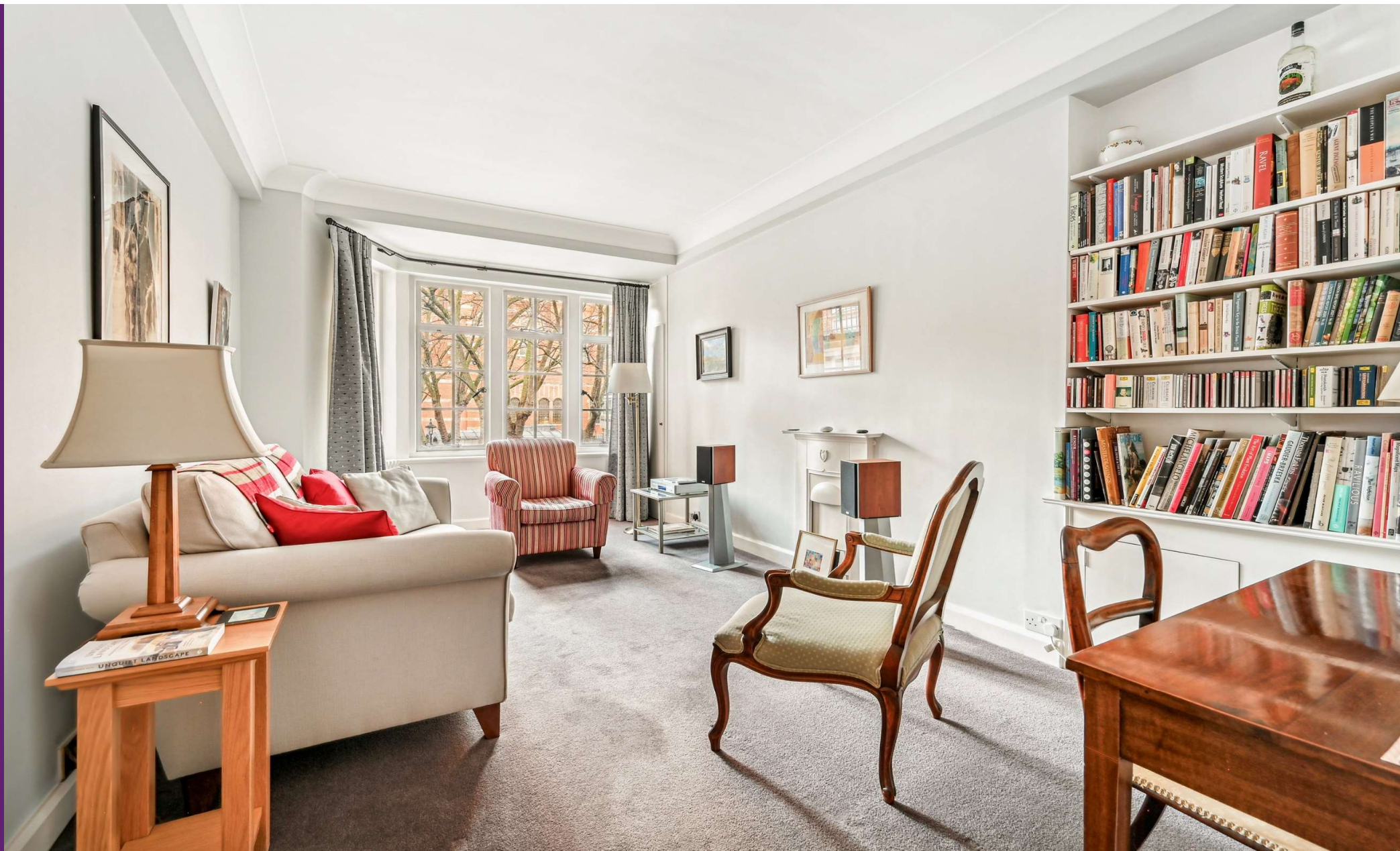
Ashley Court Morpeth Terrace, SW1P