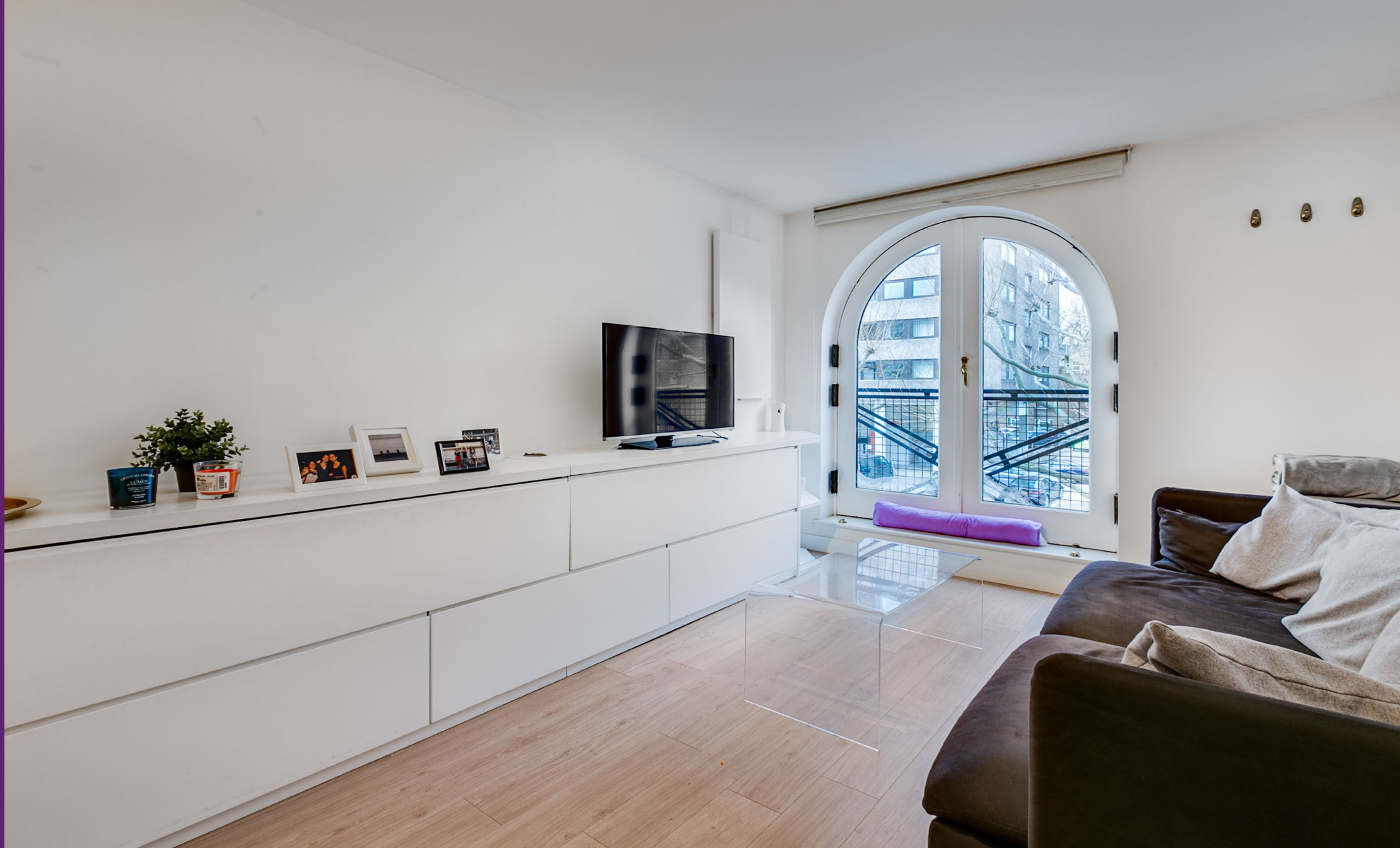
Lewcos House 57-63 Regency Street, SW1P