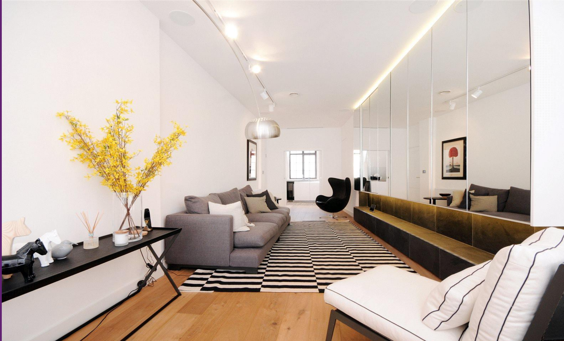
Norway House 21 - 24 Cockspur Street, SW1Y