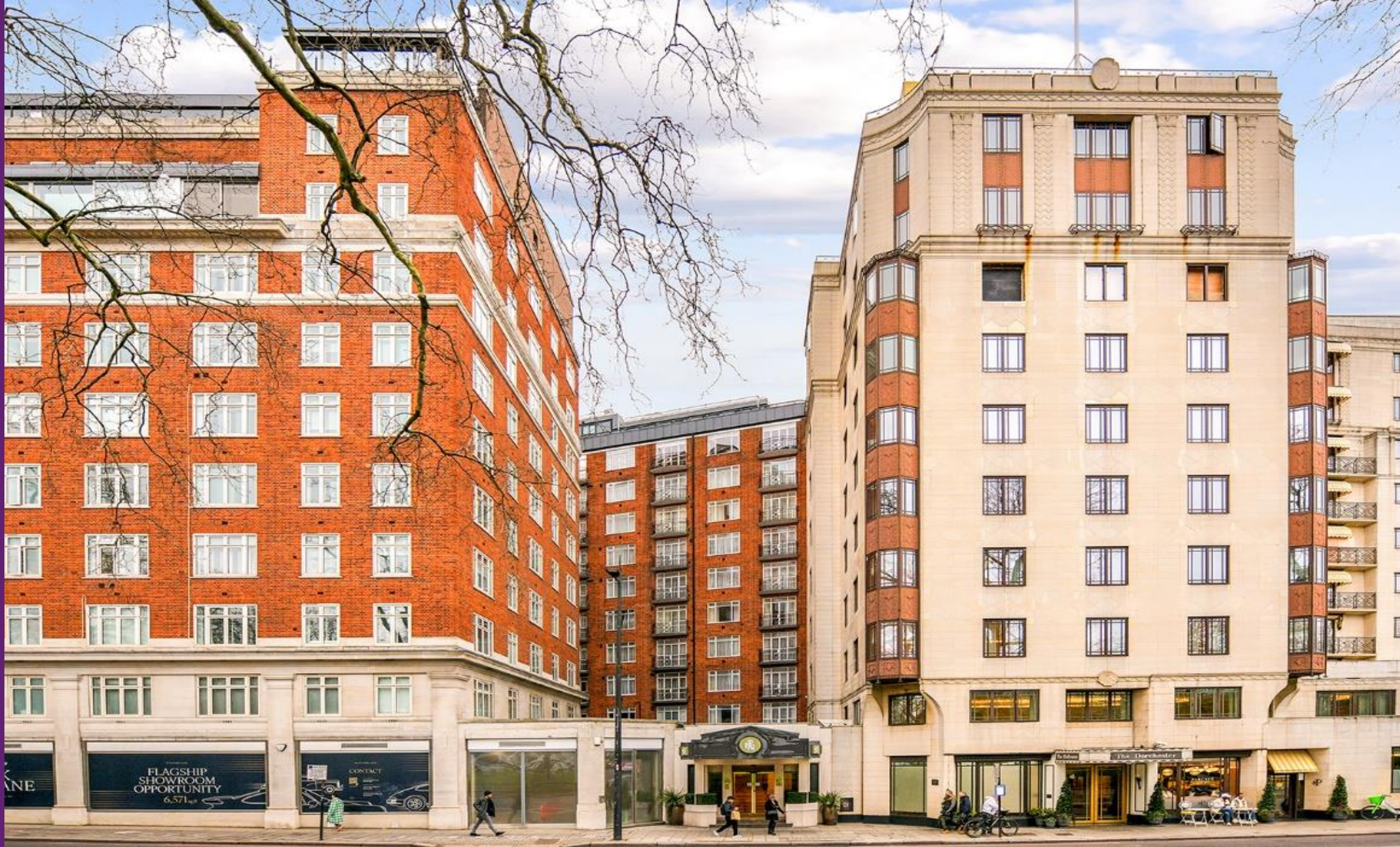
Park Lane London, W1K