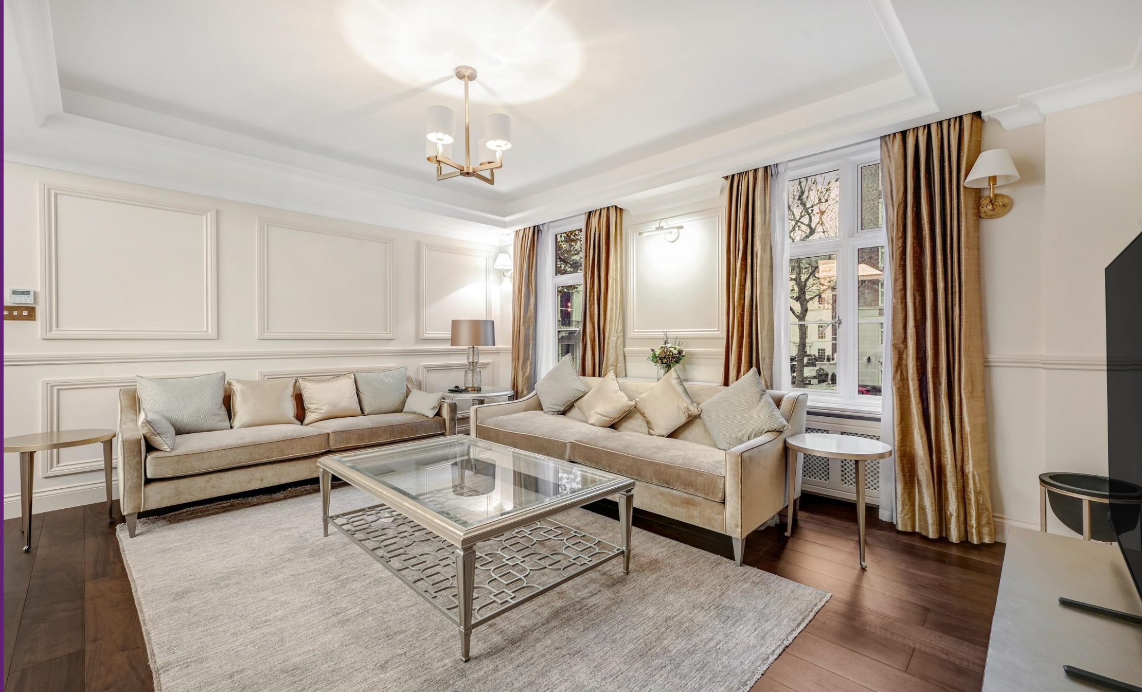
Chesterfield House Chesterfield Gardens, W1J