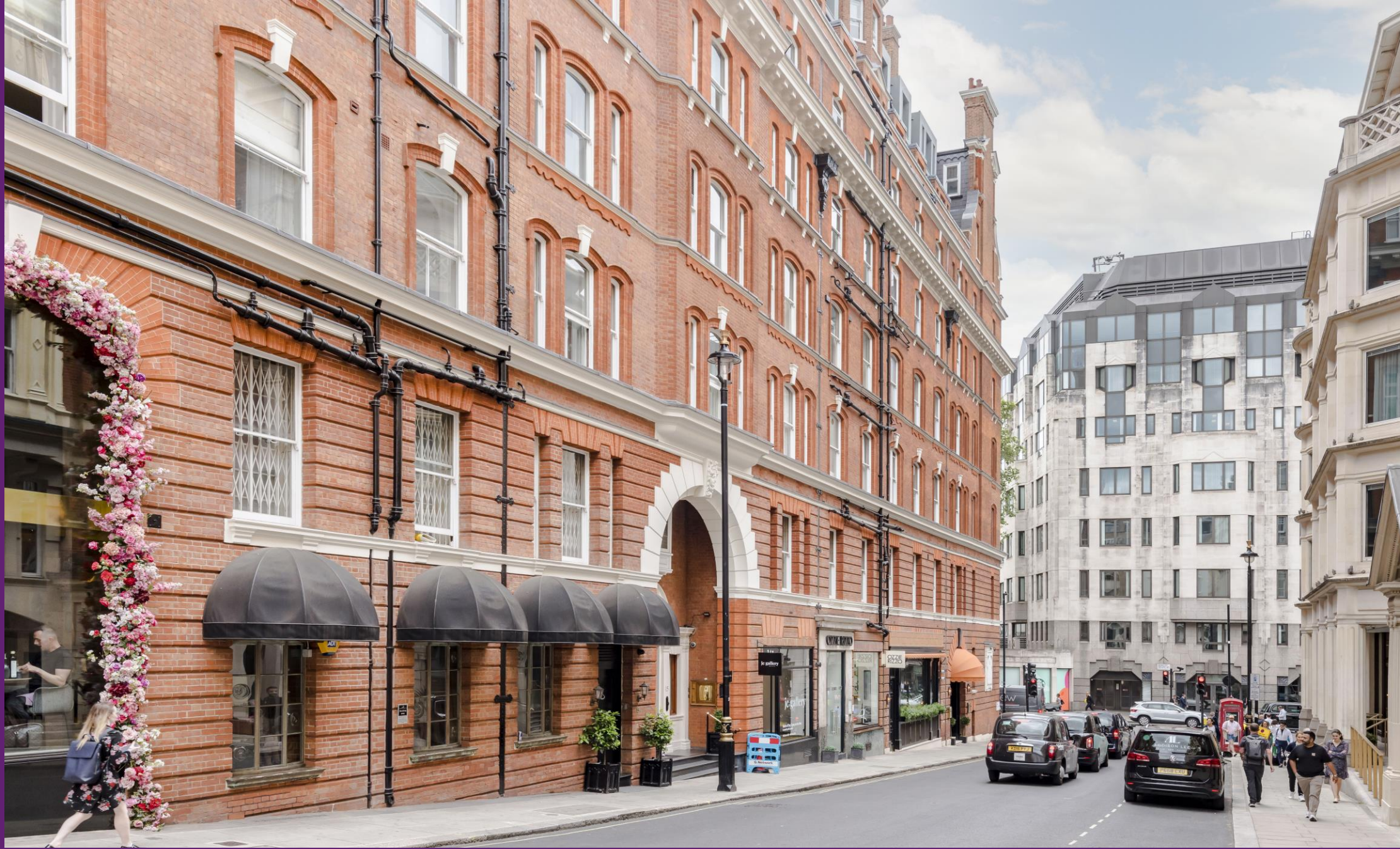
Berkeley House 15 Hay Hill, W1J