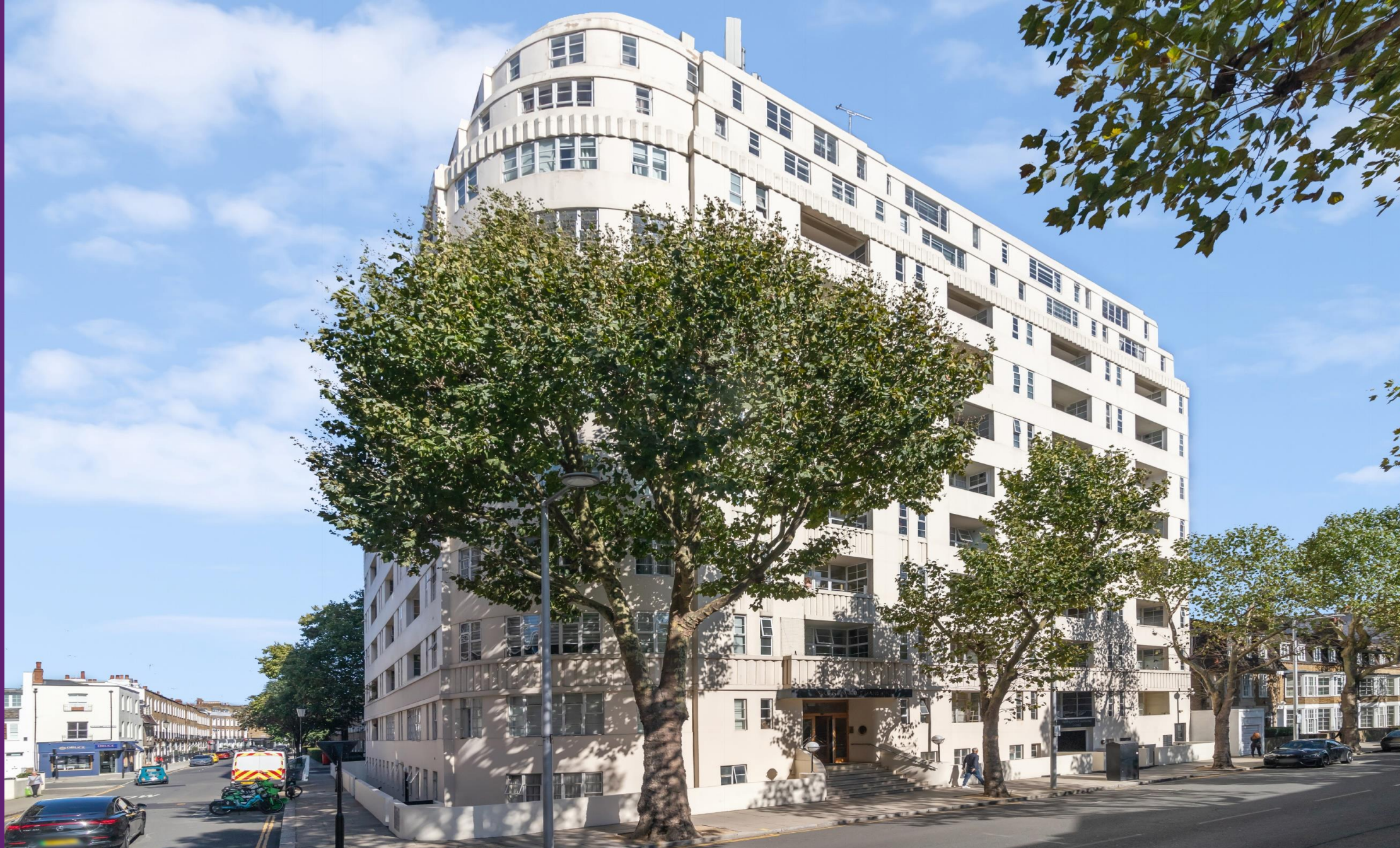
Sloane Avenue Mansions Chelsea, SW3