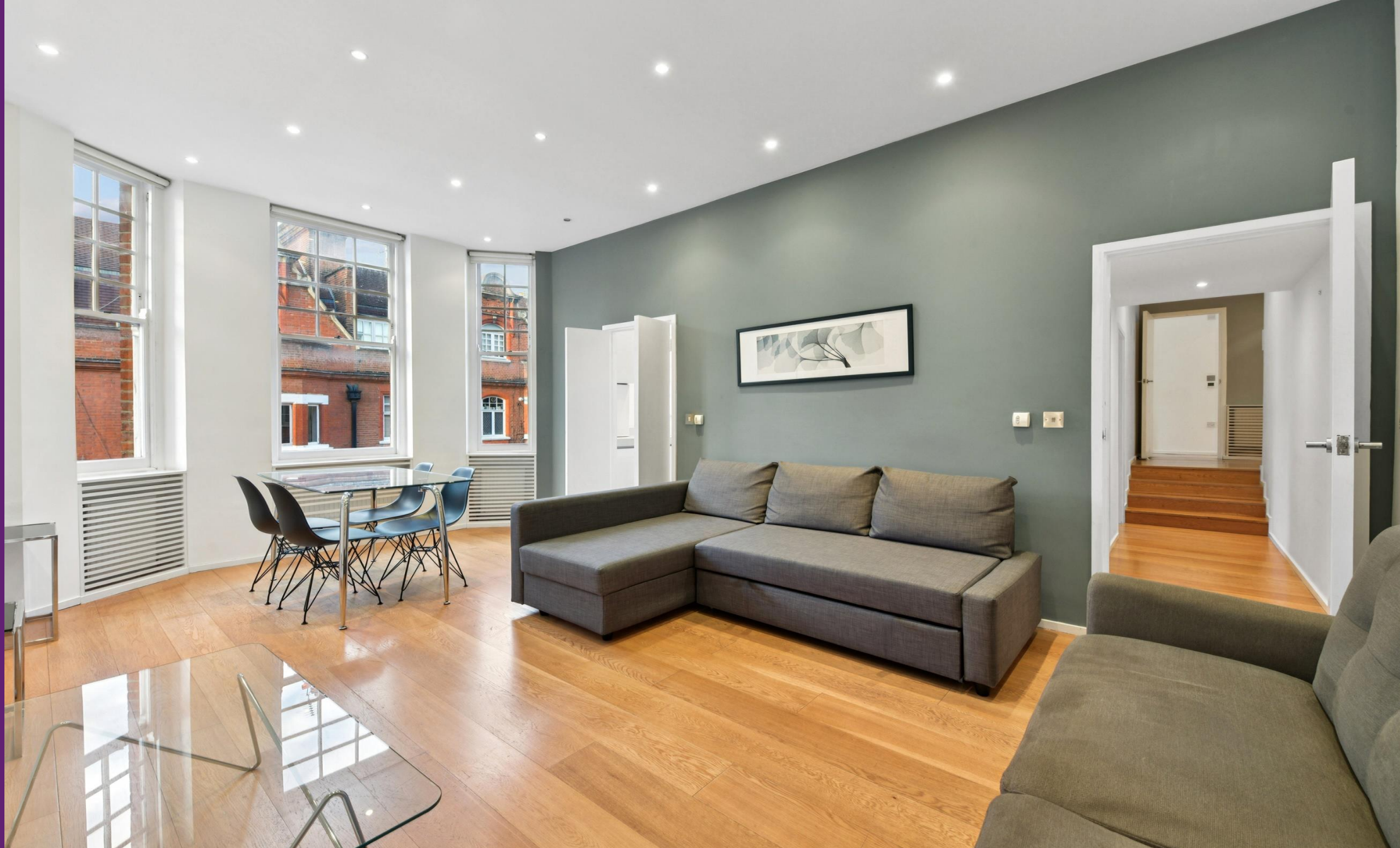
Thackeray House 1-3 Culford Gardens, SW3