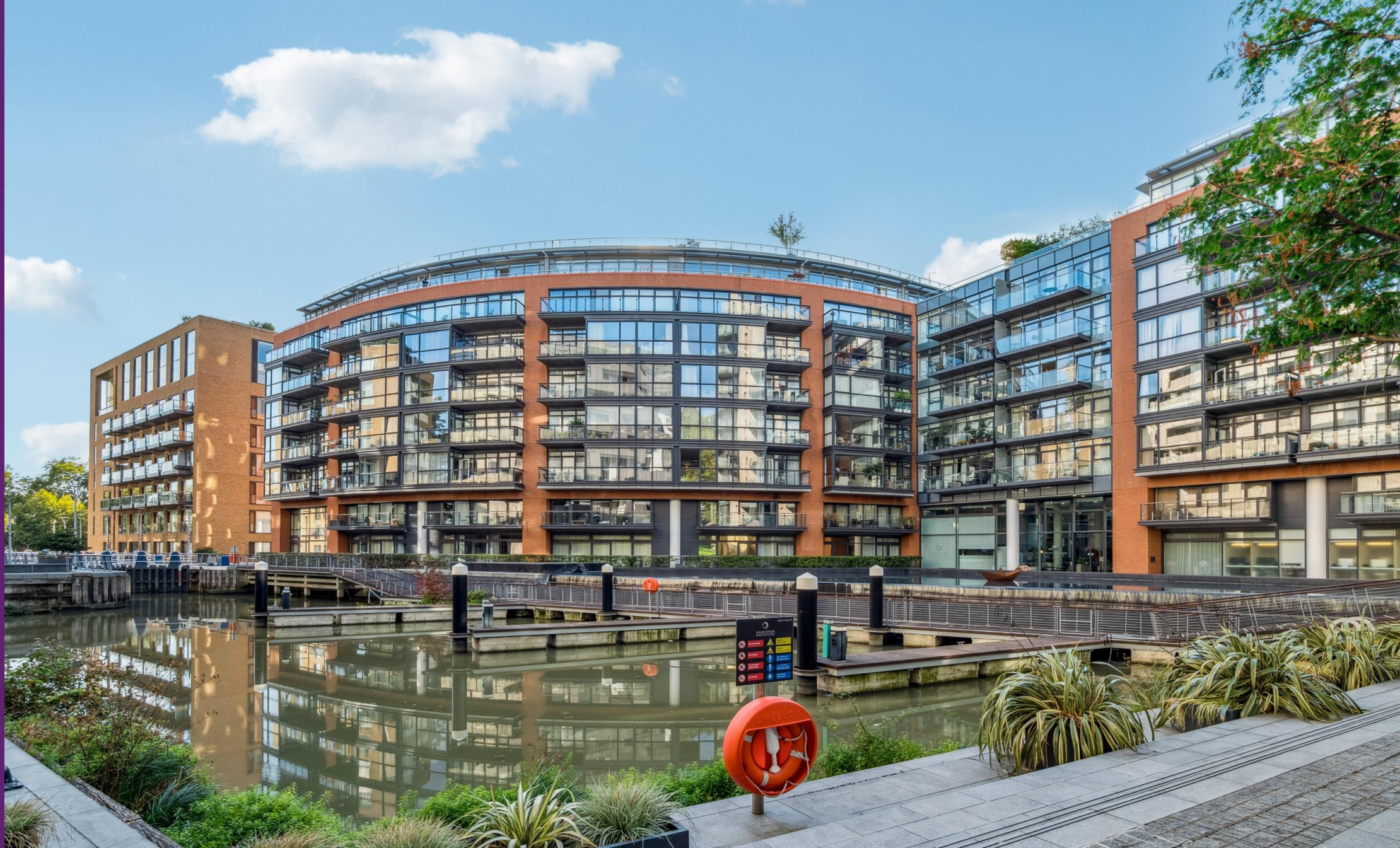
Woods House 7 Gatliff Road, SW1W