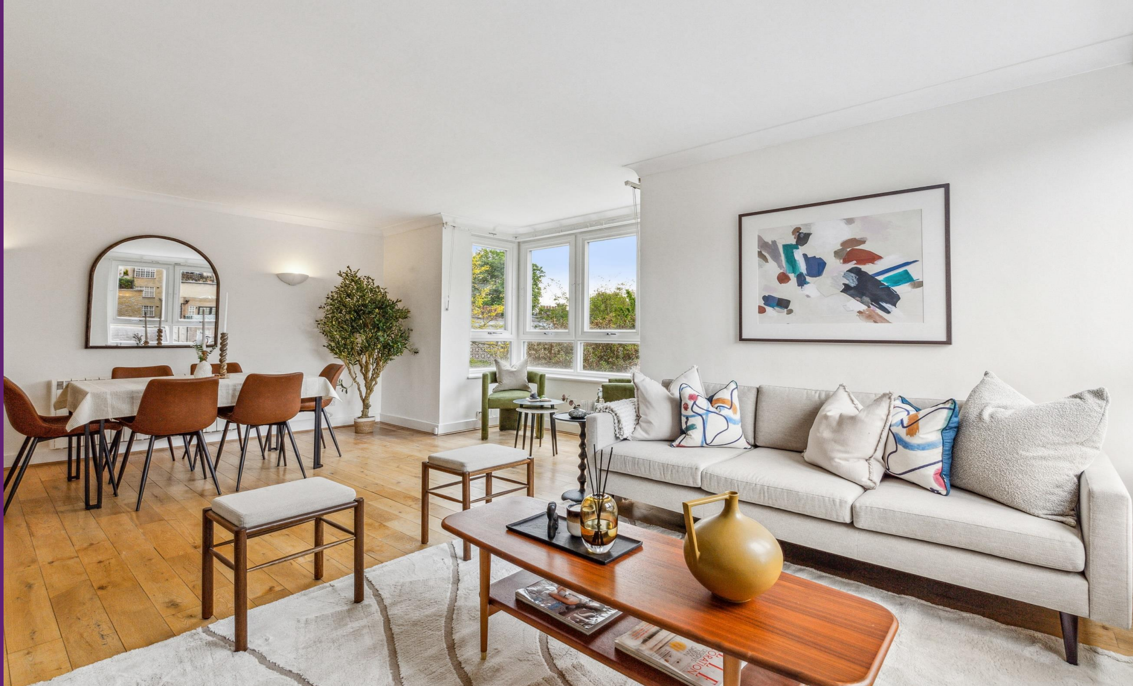
Chelsea Towers Chelsea Manor Gardens, SW3