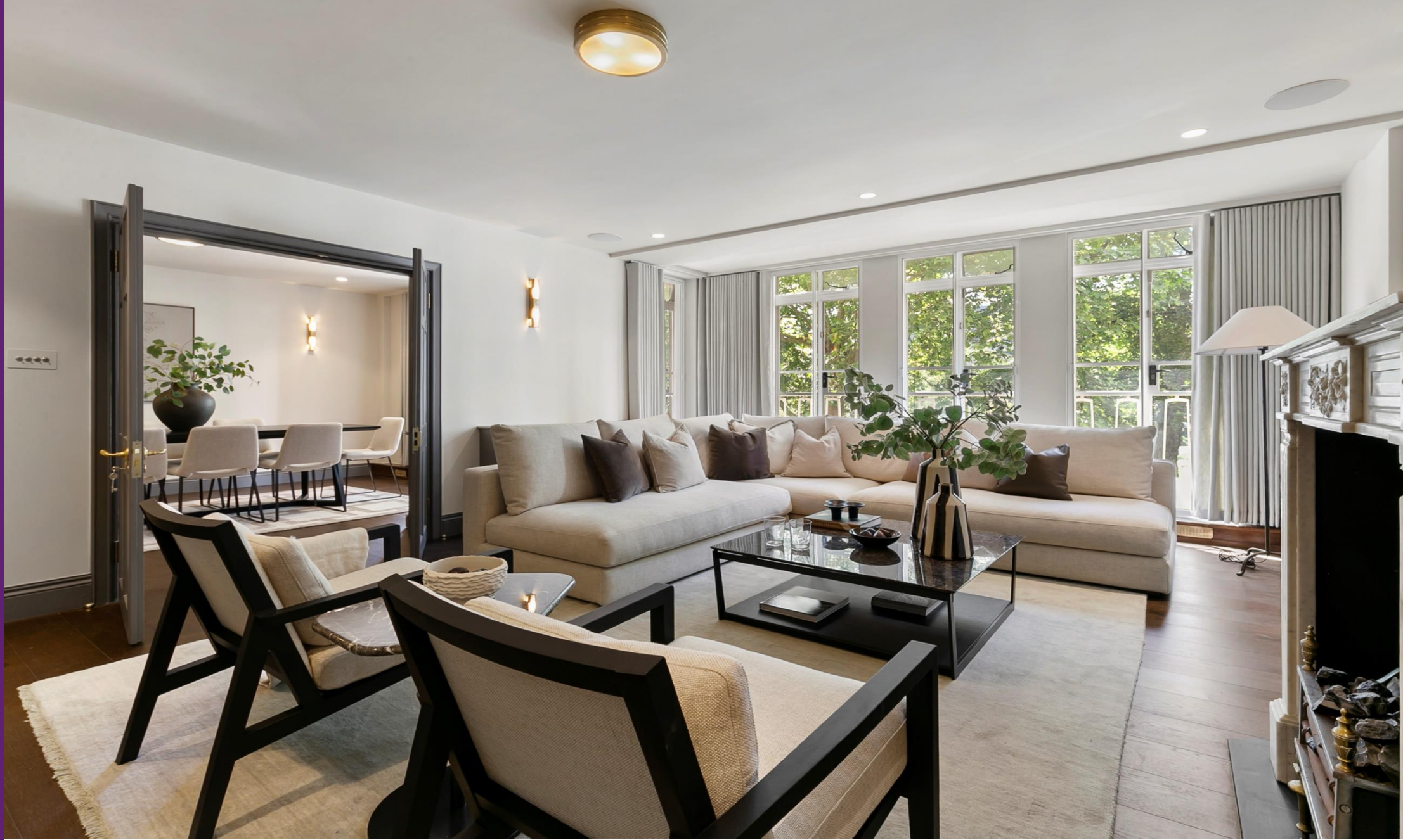
Lowndes Lodge Cadogan Place, SW1X