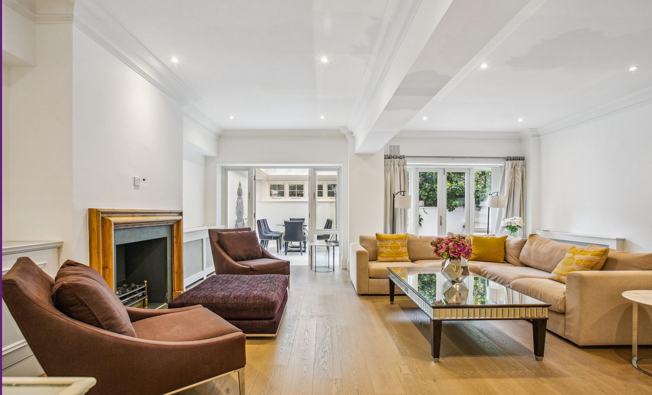
Carlton Lodge 37-39 Lowndes Street, SW1X