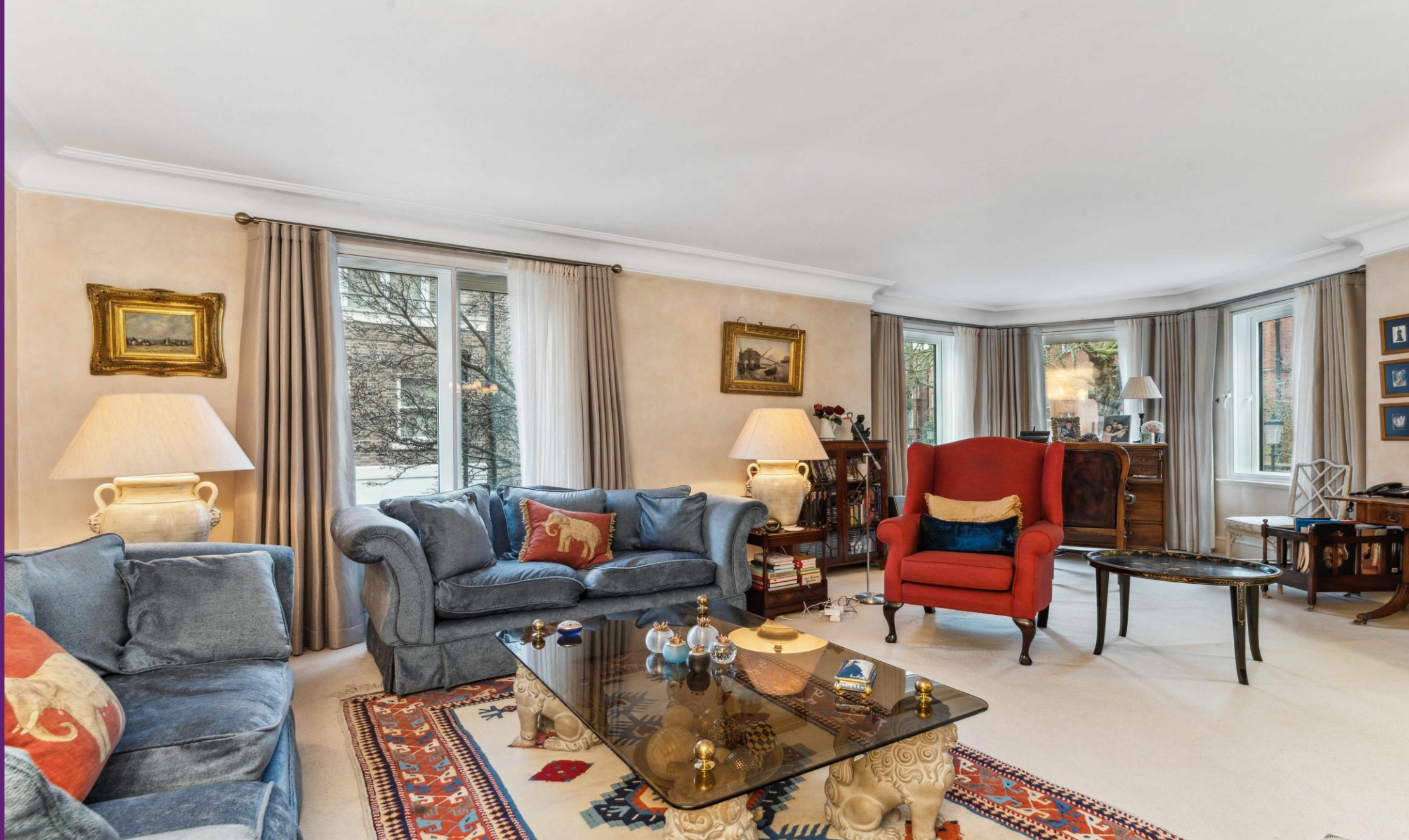
Tarnbrook Court Holbein Place, SW1W