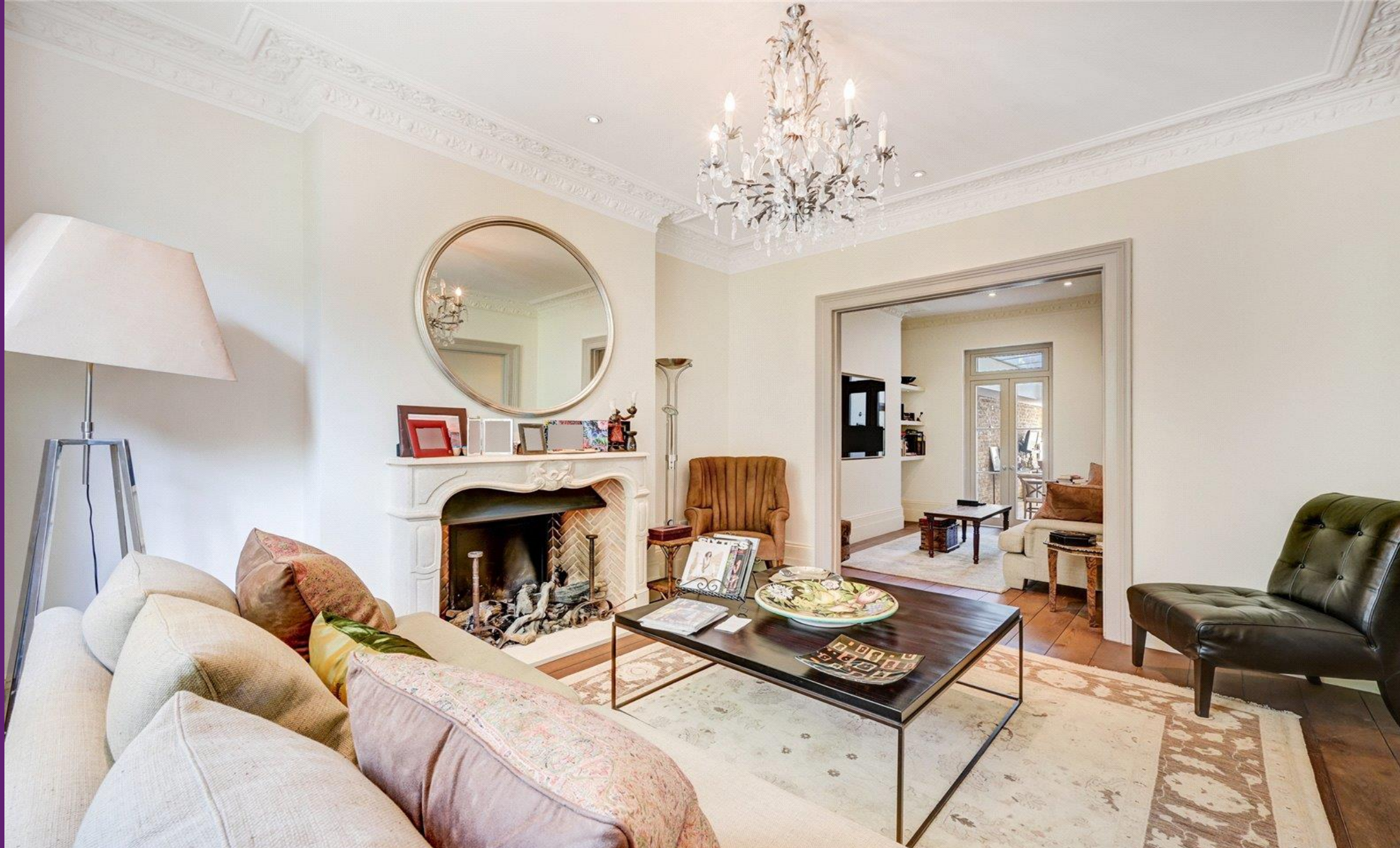
Margaretta Terrace Chelsea, SW3