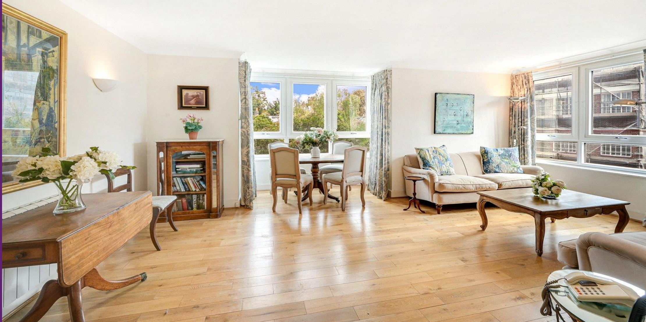
Chelsea Towers Chelsea Manor Gardens, SW3