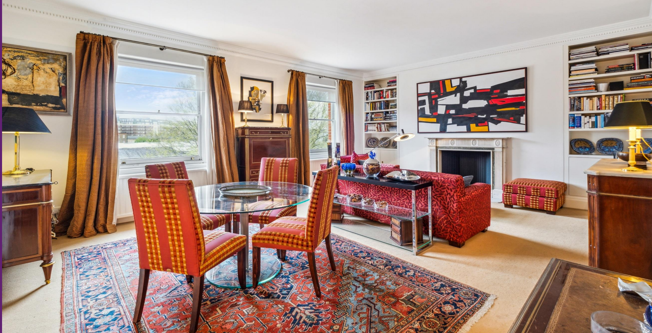
Cadogan Gardens London, SW3