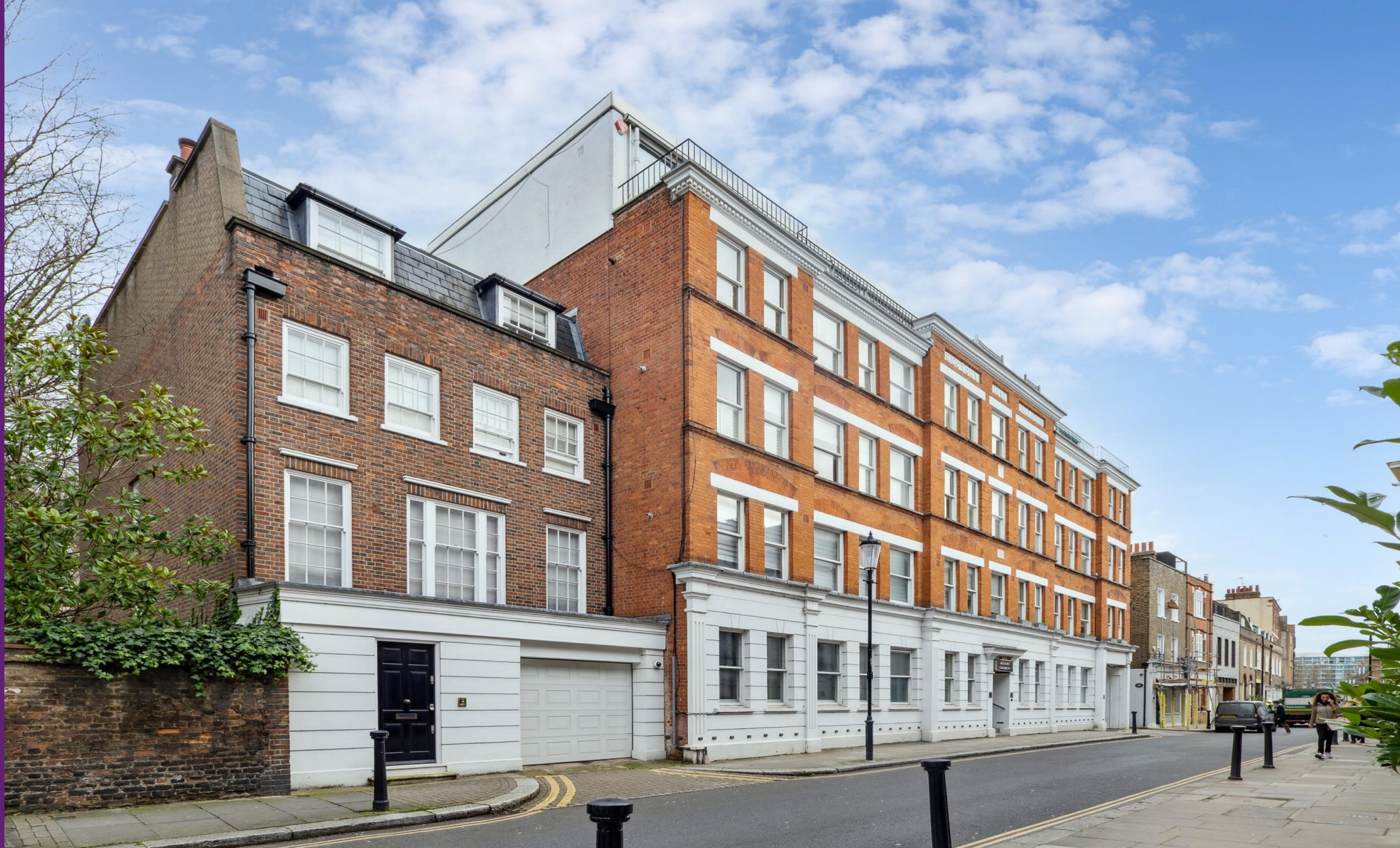
Rectory Chambers Old Church Street, SW3