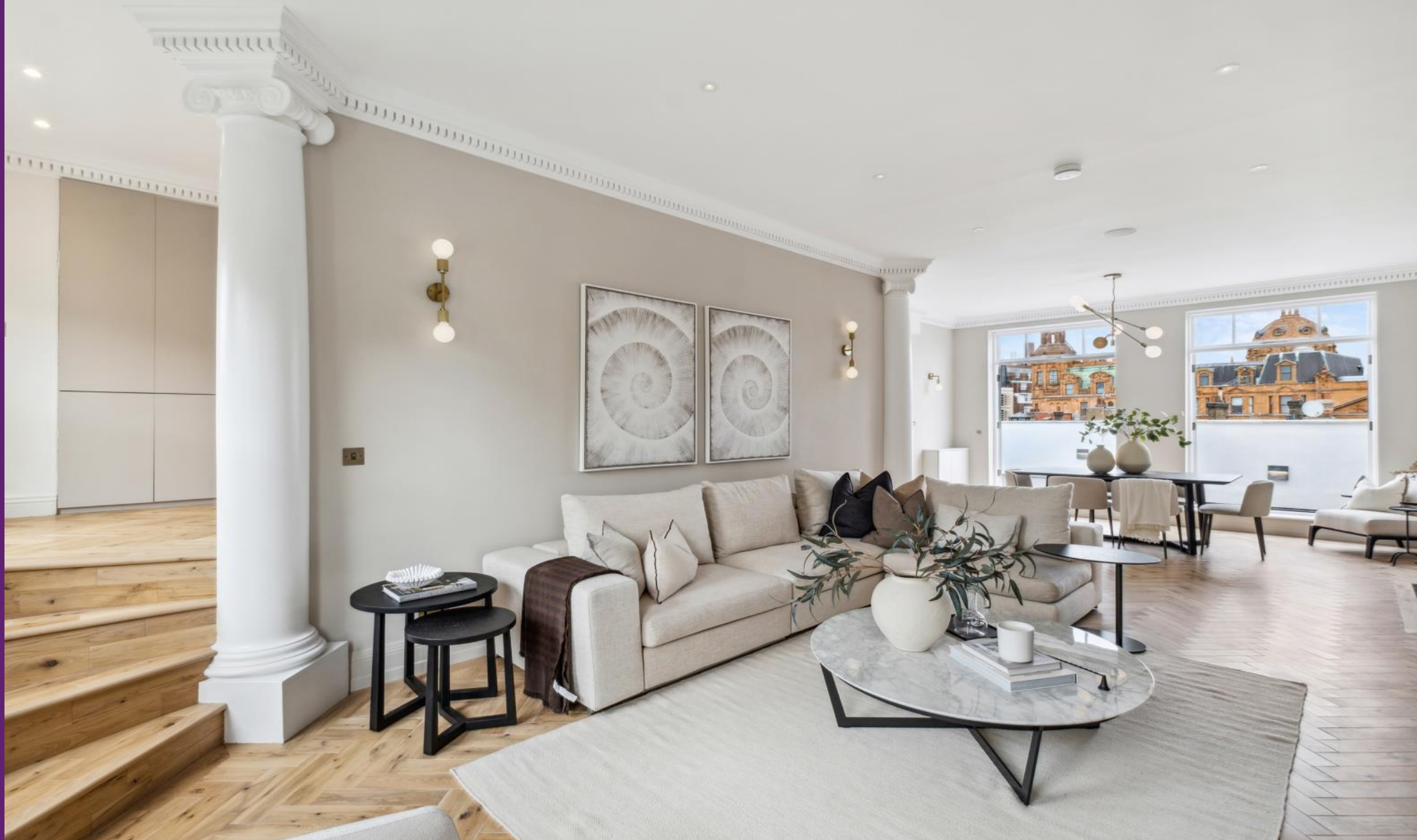
Beaufort Gardens Knightsbridge, SW3