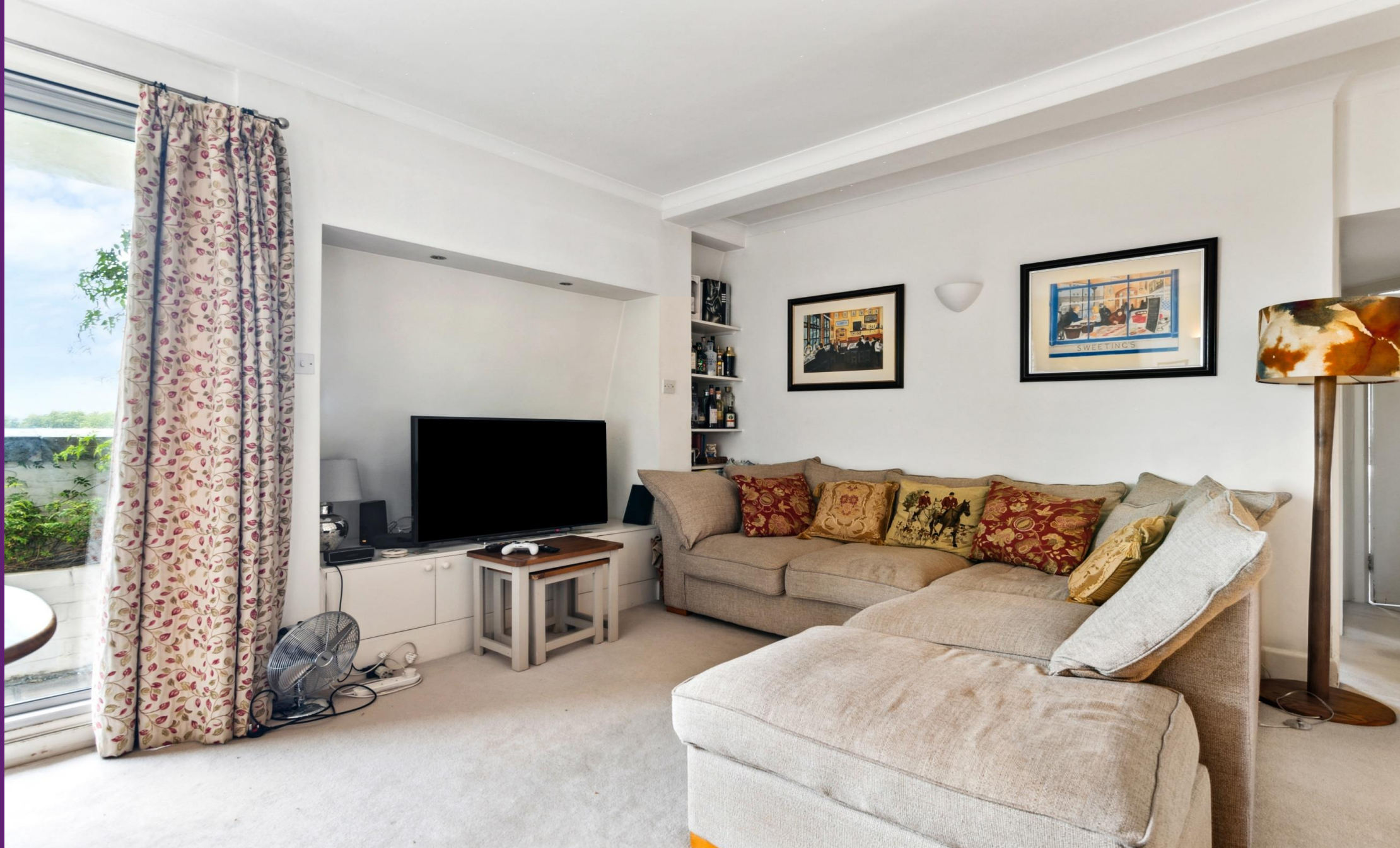
Chesil Court Chelsea Manor Street, SW3