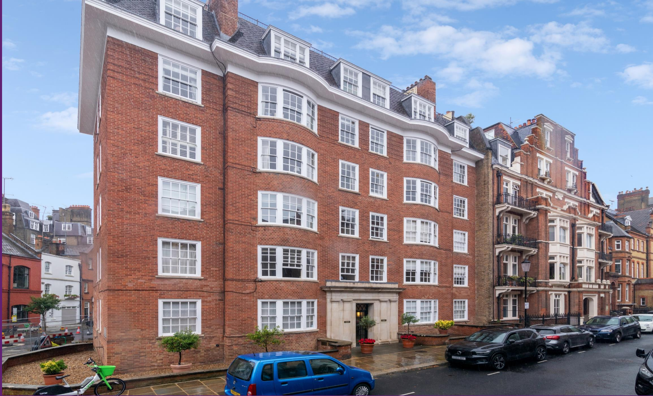
Chelsea Lodge Tite Street, SW3